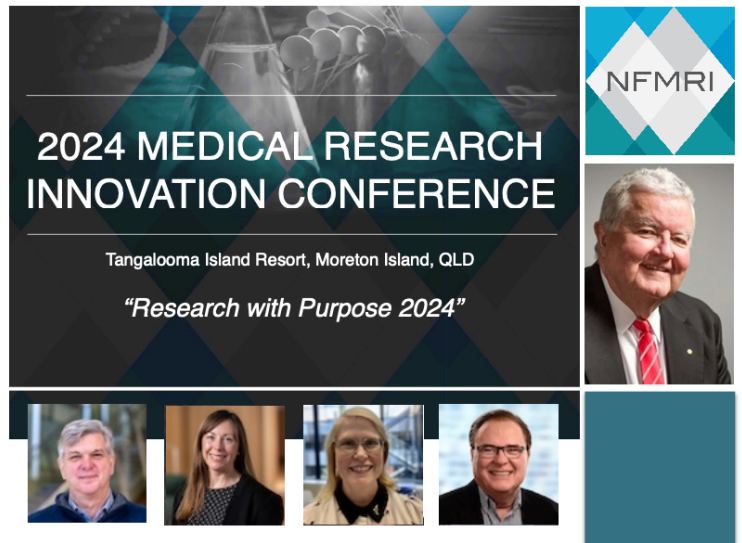
The Conference will explore strategies and solutions to help build, support and grow the biomedical innovation sector in Australia by attracting

We will continue updating the program on our website as additional speakers are confirmed.