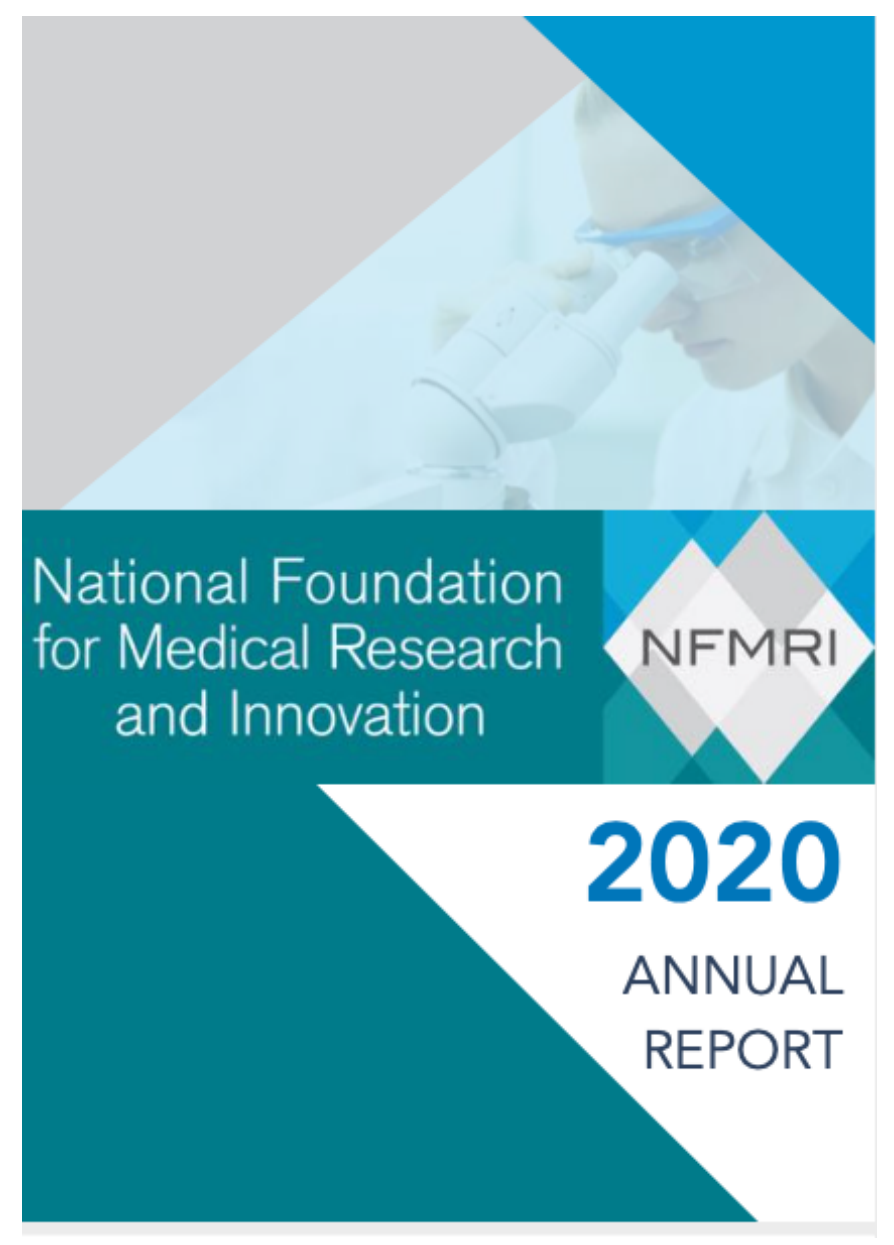
Download 2020 Annual Report

Recently released, our 2020 Annual Report showcases some of our success stories achieved over recent years thanks to our partners and supporters.